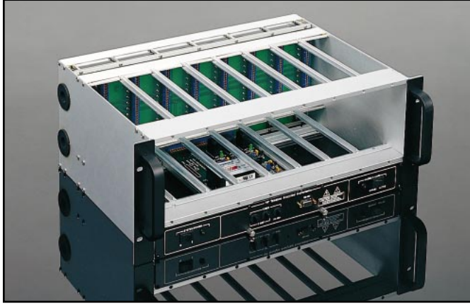
Control Module (figure 2)

The Model 1220's 1MAN calibration feature eliminates the inherent reliability problems associated with field mounted electronics. A novel software program allows the operator to apply zero and span gas to the remote detector while the calibration data is being stored in the channel module. The values are displayed on the channel module's LCD where they can be adjusted when the operator returns to the channel module location. Error codes are provided to alert the operator when calibration was unsuccessful or a fault has