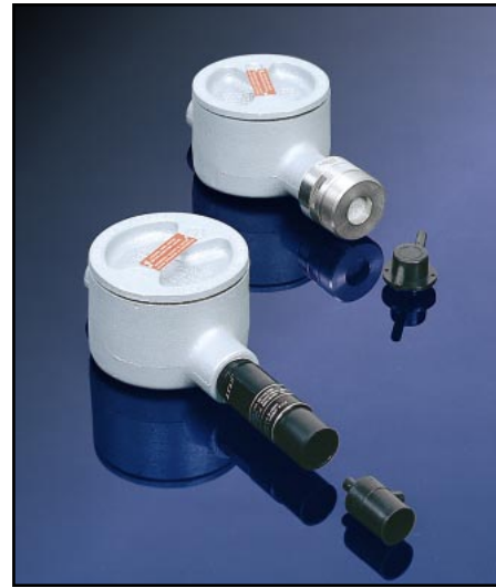
Field Mounted Detectors

A wide variety of sensor configurations are available to meet specific application requirements including stainless steel sensor housings, lead or silicone resistance, and optimization for specific gases such as ammonia.