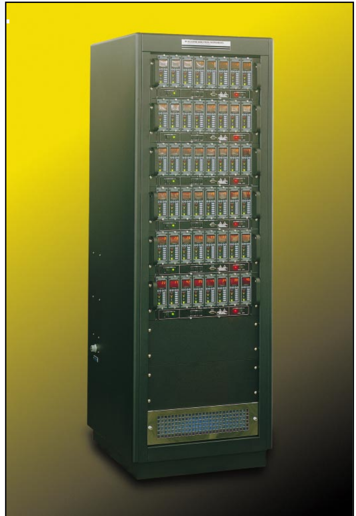
Control Module System Enclosure (figure 1)

The channel module (figure 3) is a stand-alone unit with its own microprocessor, power supplies, alarm relays, self diagnostics and controls. Easy to use and service, each channel module provides self diagnostics that automatically