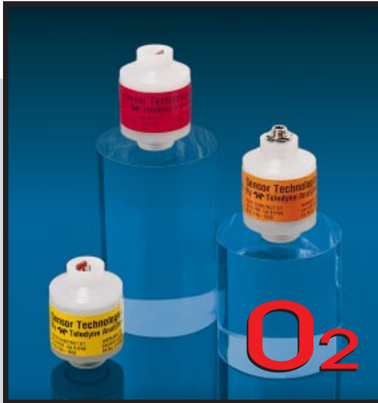
Certified: BAR97, BAR90, PTB

Teledyne Analytical Instruments has a long and successful history in the development and supply of oxygen sensors for automotive emission testing equipment. The "R" series sensors are used by most automotive emission equipment manufacturers worldwide. We are striving to improve our sensors through aggressive research and development, assuring the highest quality products offered by any supplier of oxygen analyzers.